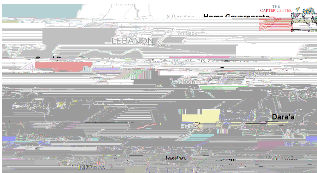
Figure 3: New and proposed settlement deals in south and central Syria between 31 May – 6 June 2021. Data from The Carter Center and ACLED.

The KAA announced the suspension of military conscription for all territories under its control. 14 The same day, the Manbij civil administration ended its curfew in Manbij. 15