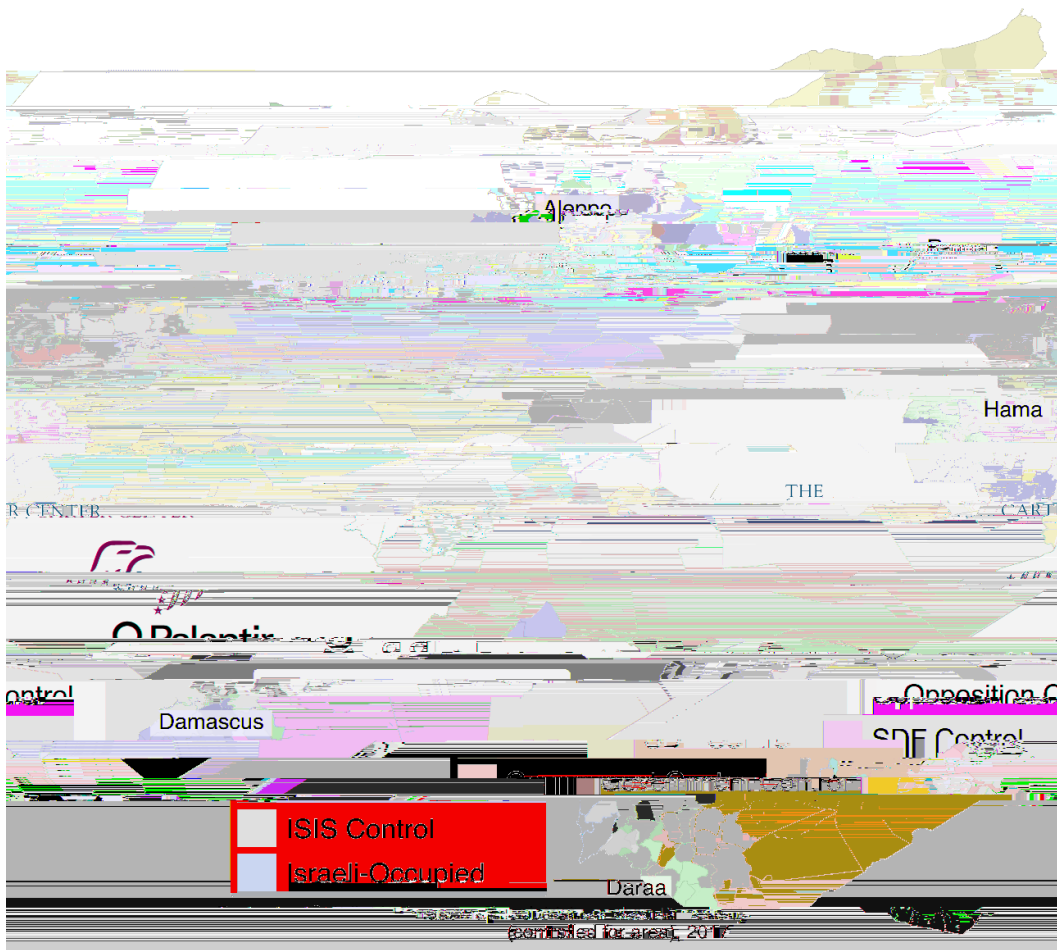
Figure 1 - Areas of control in Syria by April 18

A trilateral force including the US, UK, and France launched strikes against three military targets connected to the alleged chemical weapons attack in Duma the week before. These strikes do not appear to have led to any casualties despite the large volume of rockets launched. Experts and aid workers have been barred from entering Duma in the aftermath of a reported chemical weapons attack, largely due to Russian military police not allowing entry and pro-government militias creating an insecure environment for those entering the area. An impending pro-government offensive for Yarmouk Camp has not yet begun despite continuing troop deployment and media activity indicating an assault is imminent.