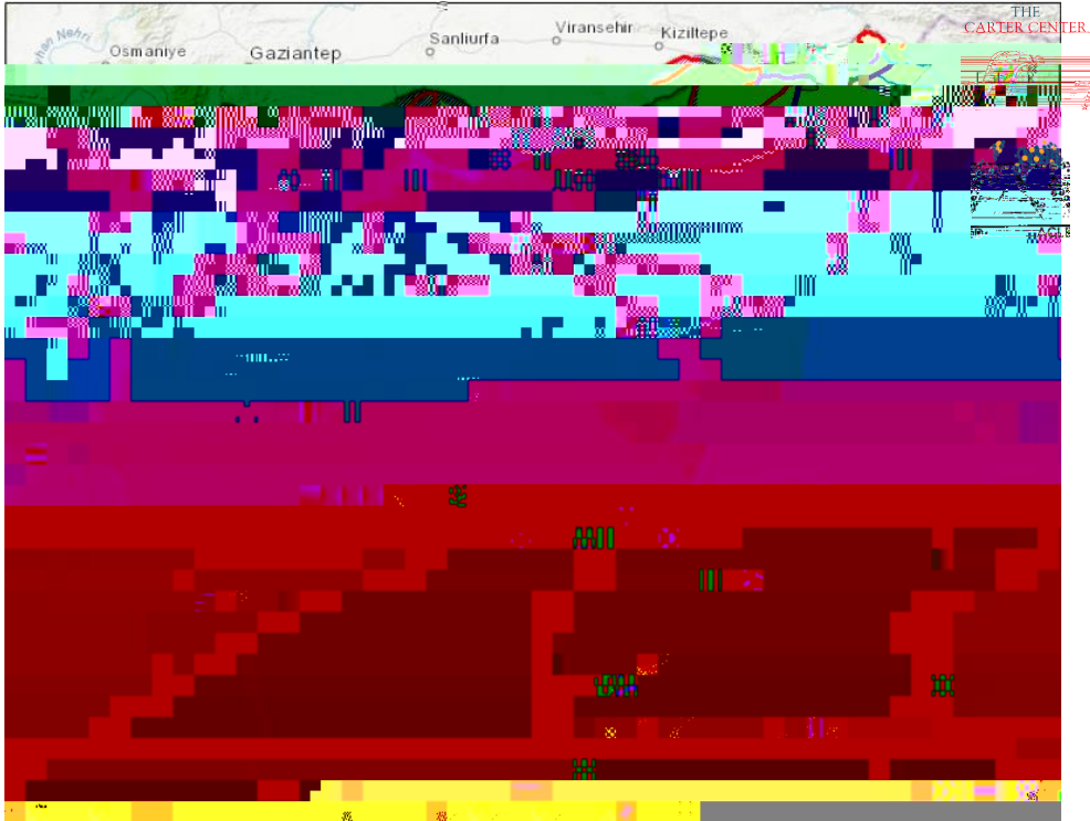
Figure 1: Dominant actors' area of control and influence in Syria as of 31 December 2021. NSOAG stands for Non-state Organized Armed Groups. Also, please see footnote 1.