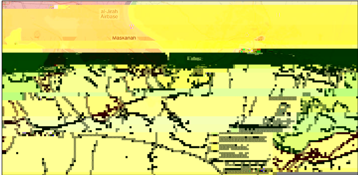
Figure 4 - Frontlines in the eastern Aleppo/western Raqqa countryside by June 14

Pro-government forces have also continued to make gains in the Tadmor countryside to the south. By June 13, pro-government forces captured Arak town and Arak gas field east of Tadmor. By June 14, pro-government forces fully captured the T-3 pumping station and surrounding area southeast of Tadmor.