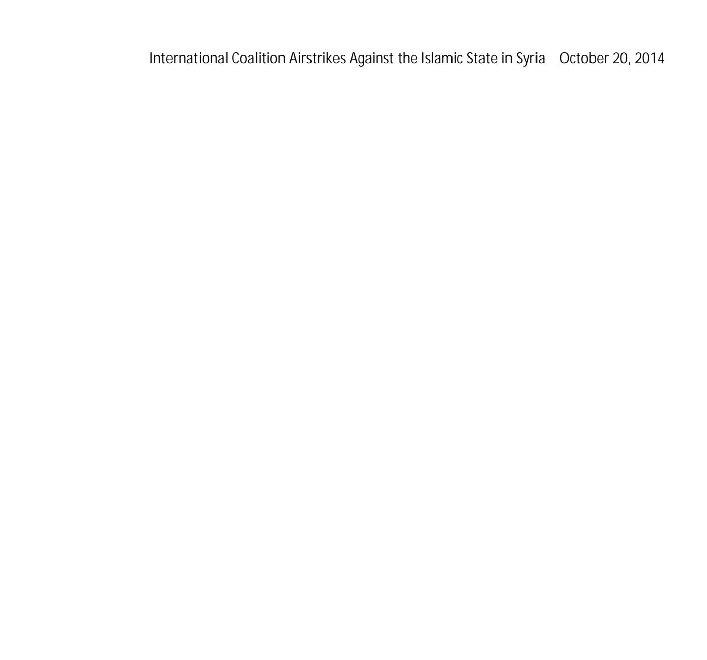
Figure 2: Areas of control and recent conflict events in and around Aleppo city (September 23-October 20).